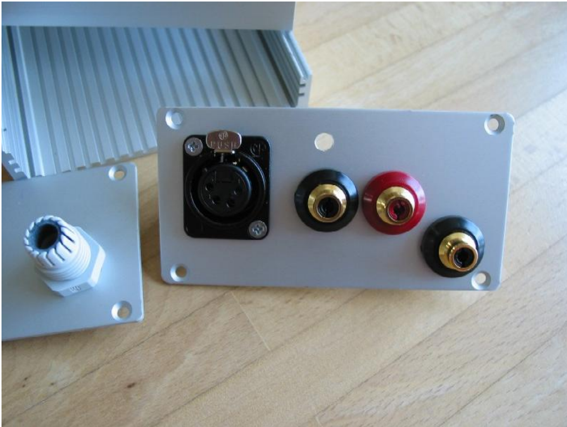
Detail of the case with front plate.