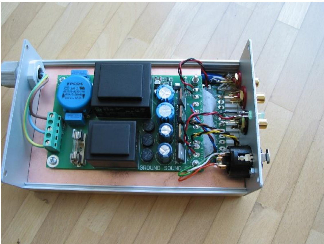
Ready for the first test. Please note the double layer copper board connected to ground to stop noise induction. PSU is mounted on 3mm spacers, DCN sits on 8mm spacers below the board. With no source signal and volume turned up completely there is no audible noise from the PSU!